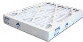
2" Pleated pre-filter

Solder-Vac II has a 1st stage dust filter, a 2nd stage high efficiency HEPA filter and a 3rd stage high density activated carbon fume filter. The final 3rd stage filters are refillable with fresh carbon granules as needed.