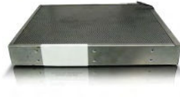
2" carbon module, 7 lbs