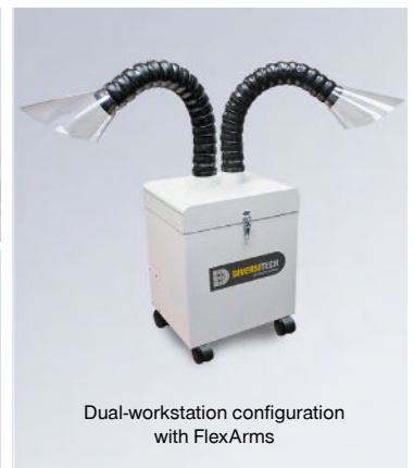
Dual-workstation configuration with FlexArms

SOLDERING • CHEMICAL VAPORS • BRAZING • LASER FUMES