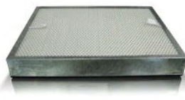
2" HEPA Filter 99.97%