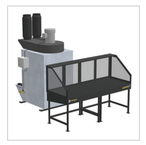
Ducted downdraft table in four standard sizes