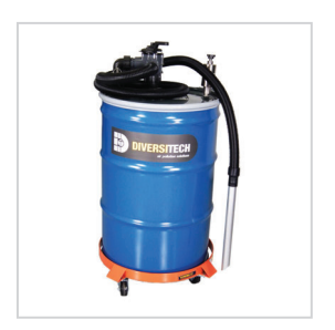
WV-55 Sludge-Vac Removal Vaccum