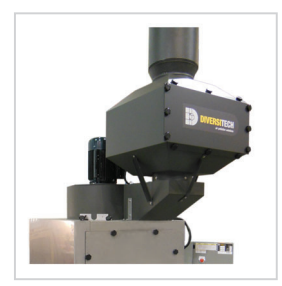
High-efficency Hepa Afterfilter kit