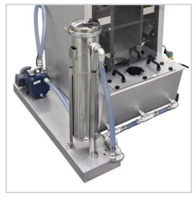
Bag strainer system to remove dust and sludge