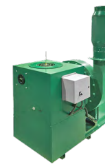
Diesel Inspection Station